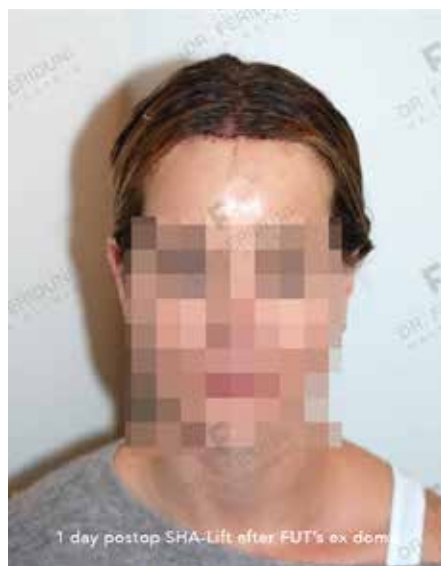
1 day postop SHA-Lift after FUT's ex demo