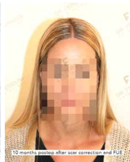
10 months postop after scar correction and FUE