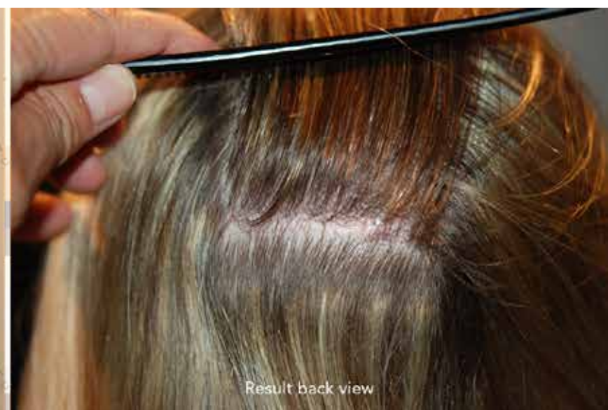
Result back view