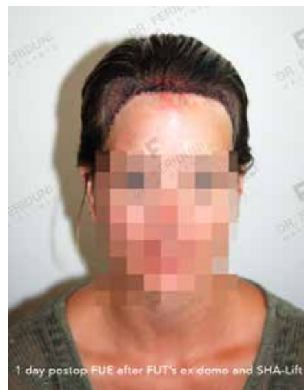
1 day postop FUE after FUT's ex demo and SHA-Lift