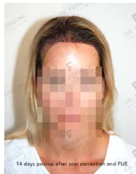
14 days postop after scar correction and FUE