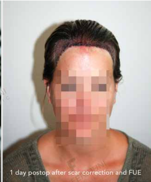
1 day postop after scar correction and FUE