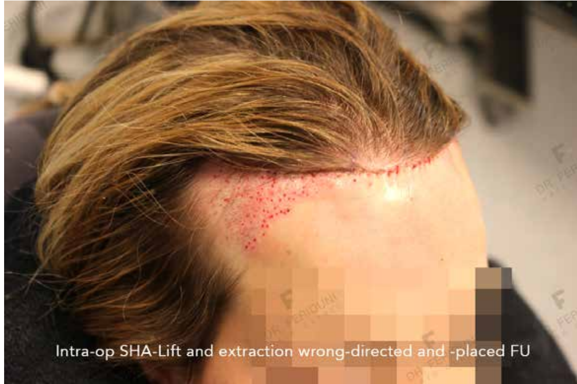
Intra-op SHA-Lift and extraction wrong-directed and -placed FU