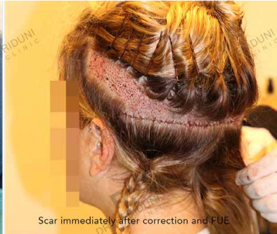
Scar immediately after correction and FUE