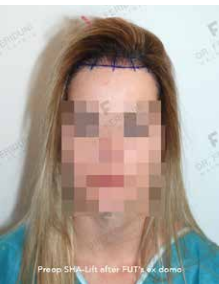
Preop SHA-Lift after FUT's ex demo